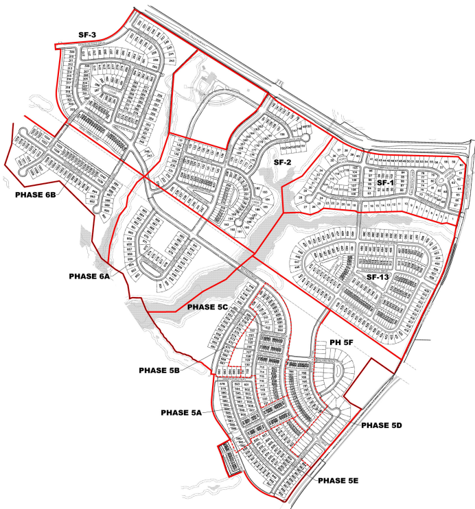
WENDELL FALLS | SF-1/2/3/13 & Phase 5/6A&B Street Names | WENDELL FALLS ® | MAY 3, 2018 | MKIM&CREED