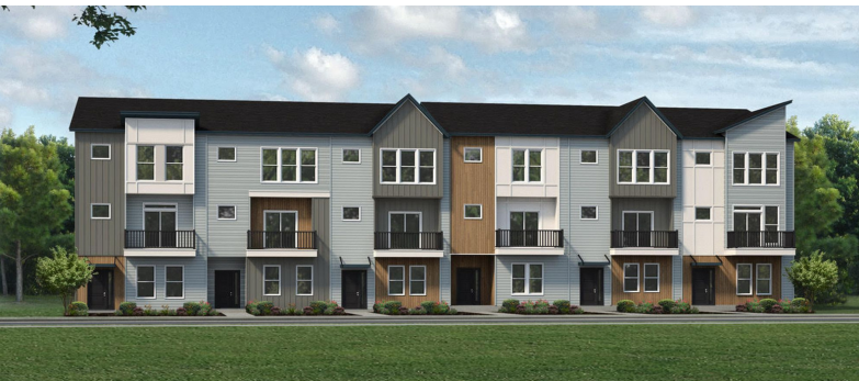
New townhomes coming soon from Homes By Dickerson (top) and Garman Homes (bottom)