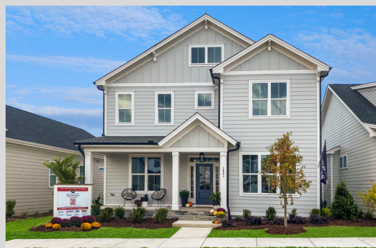
Missing Manhattan, Homes By Dickerson