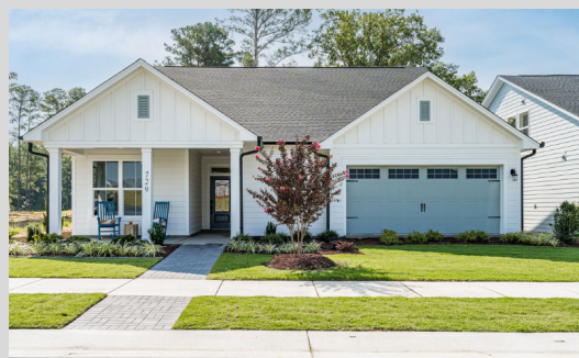
The Moorefield, Encore by David Weekley Homes