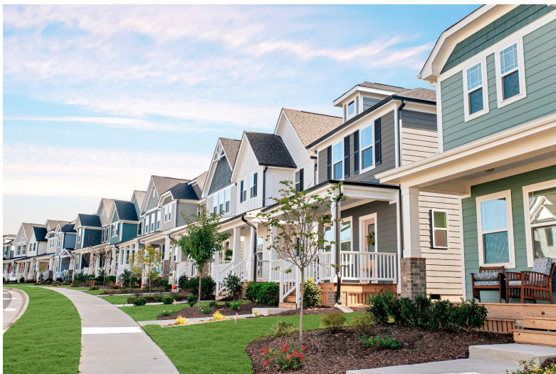
Wendell Falls had 223 new home sales in 2021

Treelight Square has really taken shape this past year, most notably with the opening of Publix and Brea Wendell Falls. We're working on new commercial deals and excited to share that with you as soon as they are finalized. Make sure you are following the Treelight Square Facebook page for the most updated commercial information.