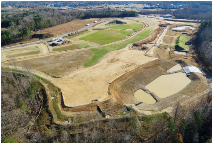
Progress on The Collective