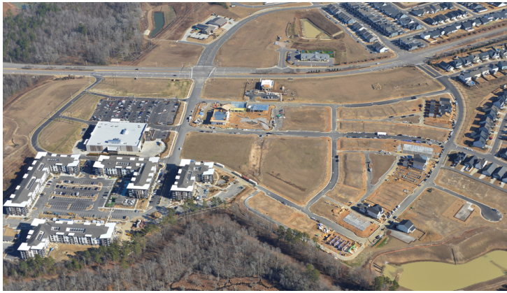
Progress on Phase 12

A map of the phases is included on the next page for your convenience. Residents can also access it any time at LifeAtWendellFalls.com .