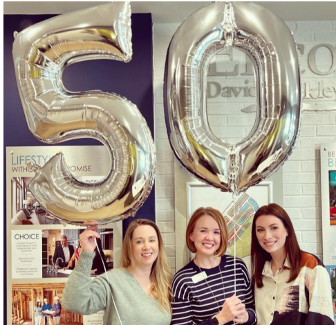
Encore celebrates their 50th sale!

Encore by David Weekley celebrated their 50th sale in February! The clubhouse is looking great—stay tuned for the big reveal.