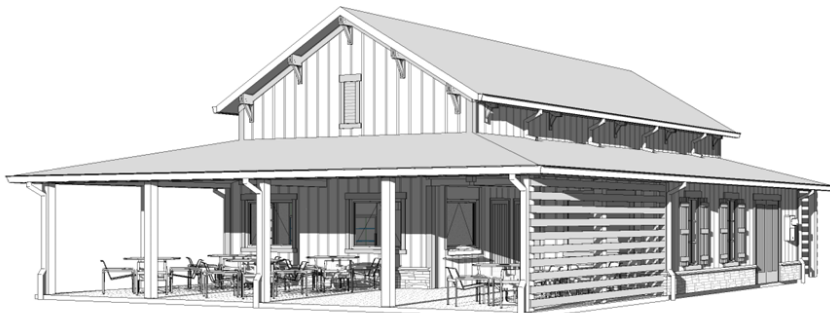
Rendering is for illustrative purposes only and is subject to change

We are proud to provide exceptional and diverse amenities to our residents, and know this will be a wonderful addition to our community!