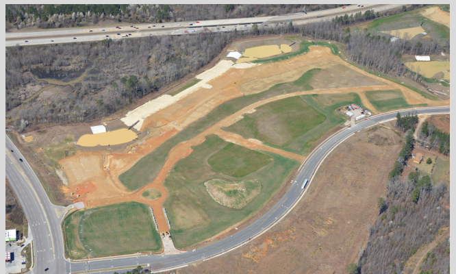
Progress on Collective, located off Wendell Valley Blvd, a convenient retail, office and residential destination.