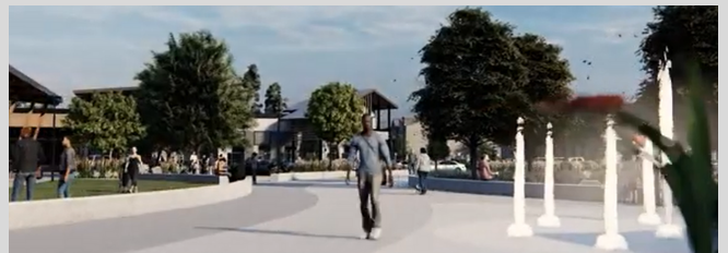
Residents of all ages will enjoy the splash pad, coming soon to Treelight Square

The first commercial lots for Collective will be delivered in fall 2022, lending itself to a mix of regional and local stores, restaurants and corporate headquarters.