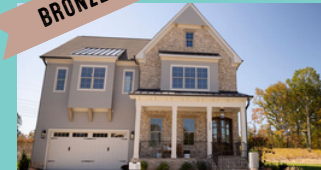
Bristol, Homes By Dickerson