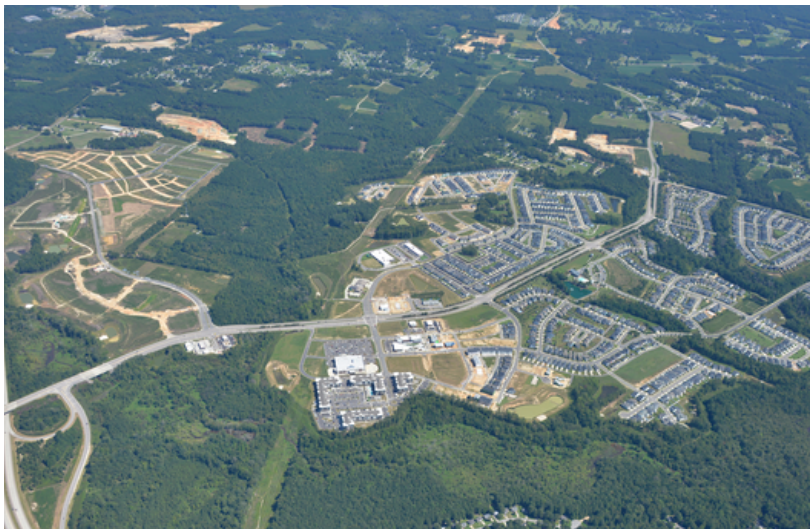
Development progress on Phases 10, 11 & The Collective

The permit for the tunnel under the parkway has been received! We have contracts out for grading and lighting and anticipate the pathway to be complete by early next year.