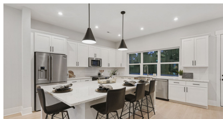
Park Ave model, Homes By Dickerson