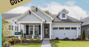
Northwind, Encore by David Weekley