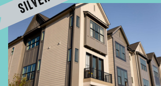
Park Ave, Homes By Dickerson