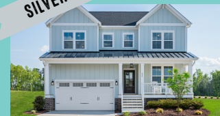
Comfort, Garman Homes