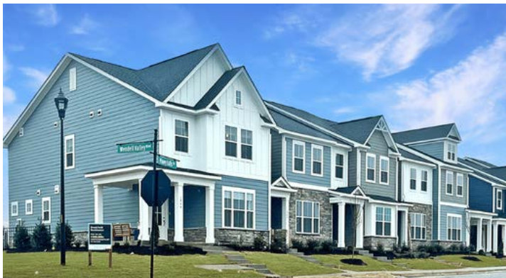
Now Open: Brookfield Residential's Lennox model home

A new park, Starry Meadow, is being installed in Phase 10 at the corner of Starry Point Road and Bright Lantern Way. This space will feature hammocks and a peaceful backdrop to stargaze and enjoy a beautiful night sky. The mailbox kiosks here will soon be outfitted in a colorful design, so be on the lookout for that addition when you pick up your mail!