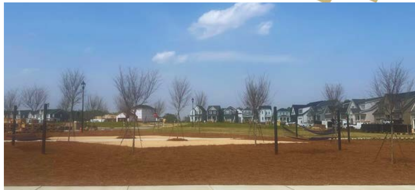
Starry Meadow (located off Starry Point Road)