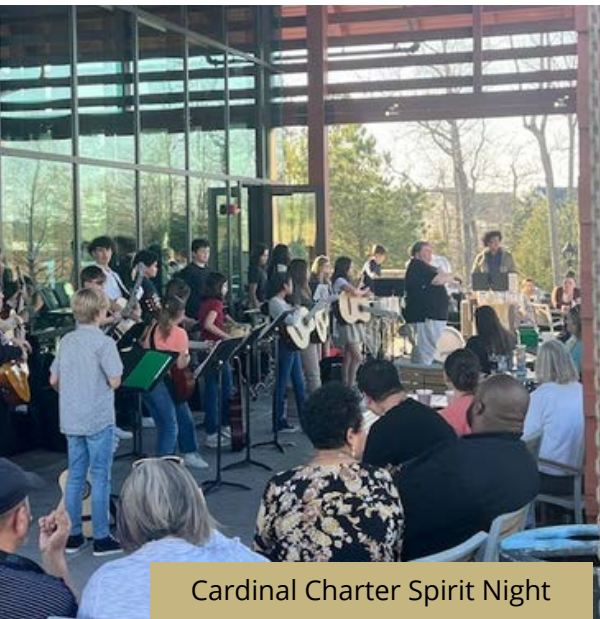
Cardinal Charter Spirit Night