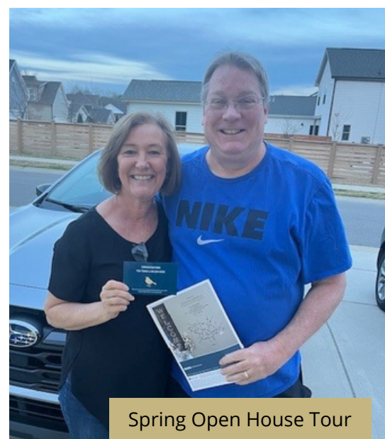
Spring Open House Tour