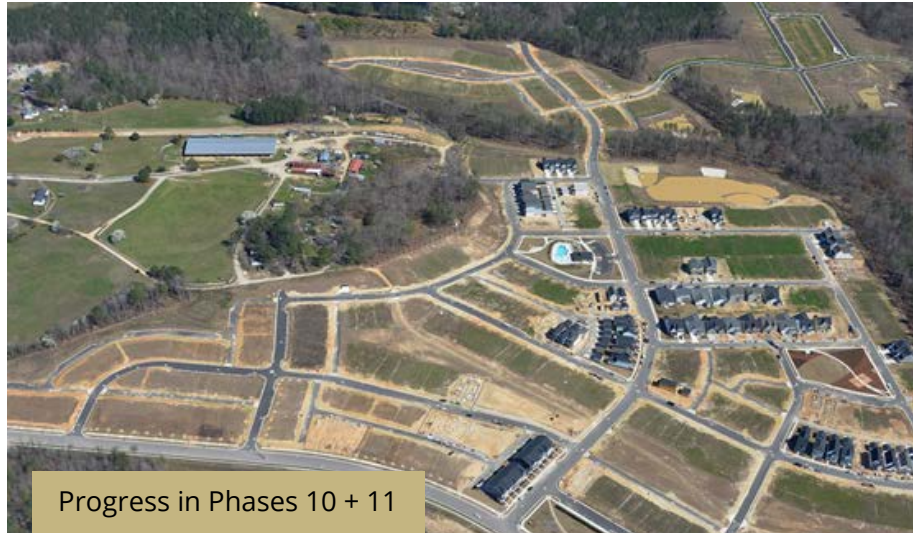
Progress in Phases 10 + 11