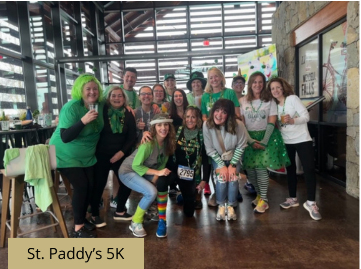
St. Paddy's 5K